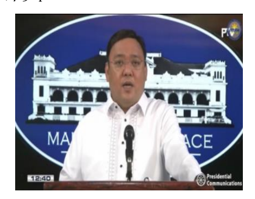
Presidential Spokesperson Harry Roque (File photo)

By Azer Parrocha September 28, 2020, 7:52 pm