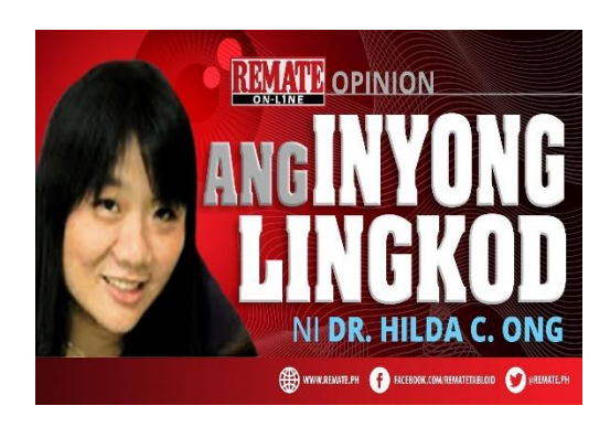
September 29, 2020 @ 12:27 AM 5 hours ago

INILUNSAD ng Department of Environment and Natural Resources (DENR) ang isang online platform na magbibigay ng access sa publiko sa iba't ibang makabuluhang pag-aaral tungkol sa kapaligiran at likas na yaman na ginawa ng Ecosystems Research and Development Bureau (ERDB).