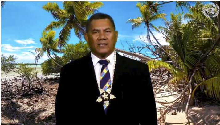
In this image made from UNTV video, Kausea Natano, Prime Minister of Tuvalu speaks in a pre-recorded message which was played during the 75th session of the United Nations General Assembly, Friday, Sept. 25, 2020, at UN headquarters.

Still, island nations have seized on the unusual circumstances to show off what's at stake.