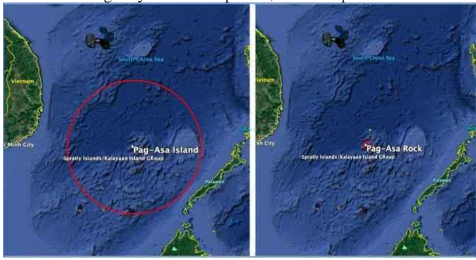
Do we want President Rodrigo Duterte to enforce arbitration award, which ruled that our islands are mere rocks with no 200-mile exclusive economic zone, just a small 12-mile territorial zone?

The panel itself called its rulings an "award" and not a decision. How can an "award," which the panel itself emphasized can be binding only on the two parties, become "part of international law"?