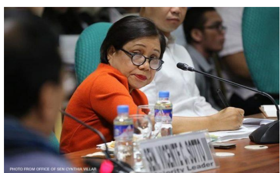
Sen. Cvnthia Villai

Sen. Cynthia Villar today asserted that the reclamation project being pushed by the Paranaque local government will cause flooding in Cavite, Paranaque, and Las Pinas and will be detrimental to the viability of the Las Pinas-Paranaque Wetland Park.