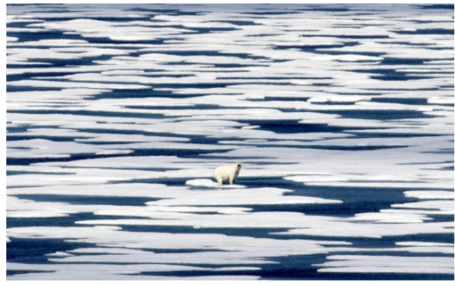
FILE - In this Saturday, July 22, 2017, file photo, a polar bear stands on the ice in the Franklin Strait in the Canadian Arctic Archipelago. In a year of cataclysm, some world leaders at September 2020's annual United Nations meeting are taking the long view, warning: If COVID-19 doesn't kill us, climate change will. With Siberia seeing its warmest temperature on record this year and enormous chunks of ice caps in Greenland and Canada sliding into the sea, countries are acutely aware there's no vaccine for global warming.

JOHANNESBURG — In a year of cataclysm, some world leaders at this week's annual United Nations meeting are taking the long view, warning: If COVID-19 doesn't kill us, climate change will.