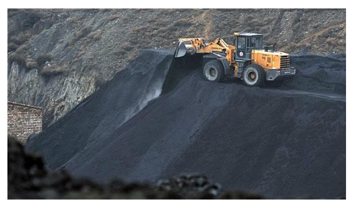
THE cause of the accident is still under investigation. W. Commons

BEIJING (AFP) — Sixteen workers died and one is in a critical condition after being trapped underground in a coal mine in southwest China on Sunday, reported state broadcaster CCTV.