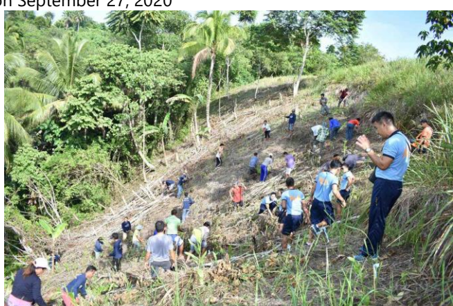
File photo of an environmental activity. Grab from file

By Marites B. PanedaPublished on September 27, 2020