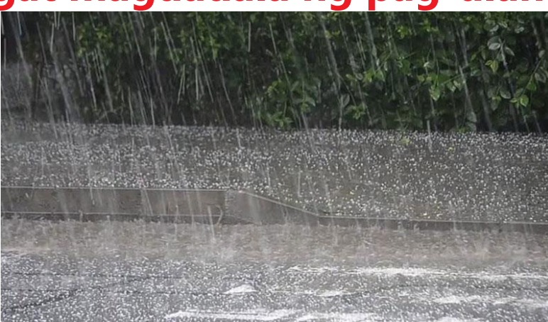
September 27, 2020 @ 8:25 AM 23 hours ago

Manila, Philippines – Magdadala ng pag-ulan ang low pressure area (LPA) at habagat sa Ilocos Region, Cordillera Administrative Region (CAR) at Cagayan Valley on Sunday ayon sa Philippine Atmospheric, Geophysical and Astronomical Services Administration (PAGASA).