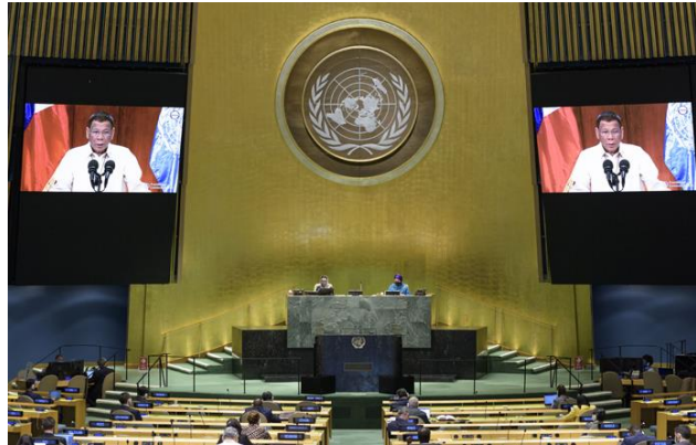
RAPT AUDIENCE. This United Nations handout photo shows President Rodrigo Duterte on large-screen monitors as he virtually addresses the general debate of the 75th session of the United Nations General Assembly, on September 22, 2020, in New York.

Critics and allies alike of President Rodrigo Duterte praised him Wednesday for invoking before the United Nations General Assembly a 2016 ruling by the Permanent Court of Arbitration that struck down China's excessive claims in the South China Sea in favor of the Philippines.