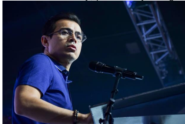
Manila City Mayor Francisco "Isko Moreno" Domagoso

Manila Mayor Francisco "Isko Moreno" Domagoso reiterated his support for the Department of Environment and Natural Resources' (DENR) Manila Bay "white sand" project, saying that it could boost tourism and business in the city, particularly along Roxas Boulevard.