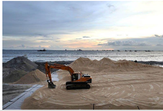
A bulldozer is seen working on the "white sand"—actually crushed dolomite rocks—poured along the shoreline of Manila Bay on September 6, 2020.