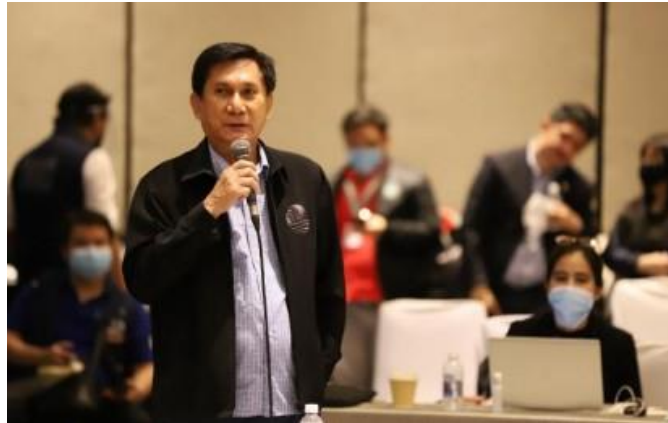
Environment Secretary Roy Cimatu

MANILA – Environment Secretary Roy Cimatu on Tuesday said he felt “elated and overwhelmed” by the praise and support the Manila Bay beach nourishment project has received from President Rodrigo R. Duterte and the public.