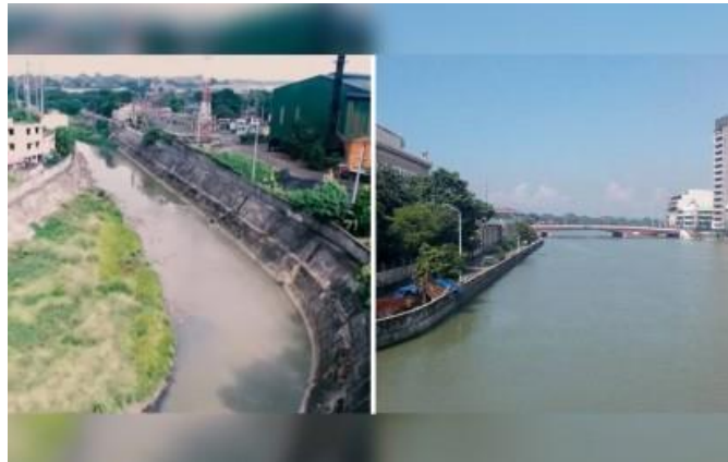
Tullahan and Pasig Rivers

MANILA -- San Miguel Corporation (SMC) is targeting to dredge a total of 700,000 tons of garbage from the Tullahan River and Pasig River every year, as clean-up operations in Tullahan continue to remove 600 tons of garbage daily since resuming operations with the lifting of restrictions in June.