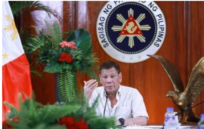
President Rodrigo Duterte

By Azer Parrocha September 23, 2020, 1:01 pm