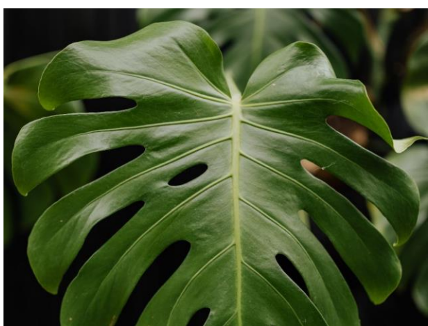
A mature Monstera deliciosa, or swiss cheese plant, now fetches at least P3,000 ($62), compared with as little as P800 hefore

The pandemic has set off a wave of theft in the Philippines. The target? Plants.