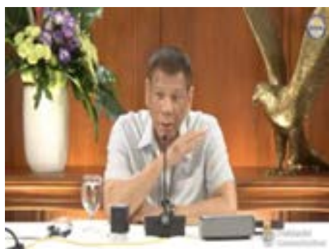
Pres. Rodrigo Duterte.

"Ito kasi mga kababayan ko, ito 'yung mga ginawa nating preventive measures. Kagaya ng COVID quarantine, nakatulong talaga 'yun. Malaking tulong 'yun because kokonti lang ang tao naglalakad na maco-contaminate ng iba," he said.