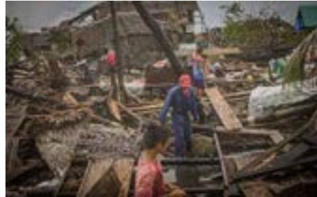
Residents try to salvage belongings among their houses destroyed at the height of Typhoon Vongfong in San Policarpio town, Eastern Samar province on May 15, 2020, a day after the typhoon hit the town.