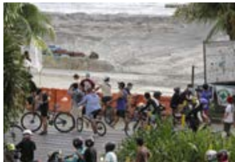
Filipino bikers along Manila Bay

Vice President Leni Robredo questioned the funds used for the controversial Manila Bay “white sand” project after the Palace claimed that it could improve the Filipinos’ mental health.