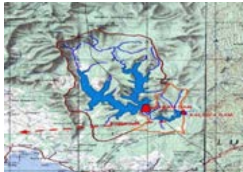
Map from MWSS shows location of Kaliwa Dam