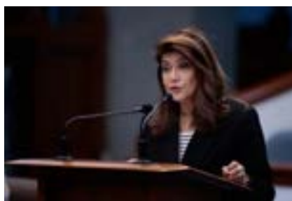
Senator Imee R. Marcos

Senator Imelda “Imee” Marcos on Monday urged the government to solve the impasse in negotiations with tribal communities affected by the Kaliwa Dam project as the ongoing disruption on water supply has raised concern over the long-term water security of Metro Manila and neighboring cities.