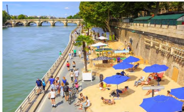
PARIS ON THE SAND Paris Plage on a stretch of the Seine riverbank.

It's not a new idea. In 2002, the French capital introduced the idea of the "Paris Plage," which later became "Paris Plages" or Paris Beaches. Just like here in Manila, just like now, the moment the Parisians, critical by default, caught sight of then Paris Mayor Bertrand Delanoë trucking sand, along with palm trees, into the city, they were up in arms, lamenting the frivolity as well as the cost of the project.