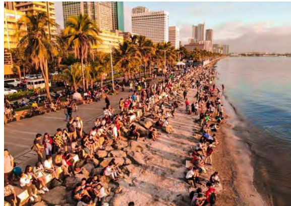
BEACH IN THE CITY The baywalk on Manila Bay after its rehabilitation last year.

Artificial beaches have a purpose—and here are others from all over the world