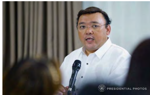
Presidential Spokesperson Harry Roque

Citing information from the Department of Environment of Natural Resources (DENR), Presidential spokesman Harry Roque said crushed “dolomite boulders” are actually being used in the rehabilitation project.