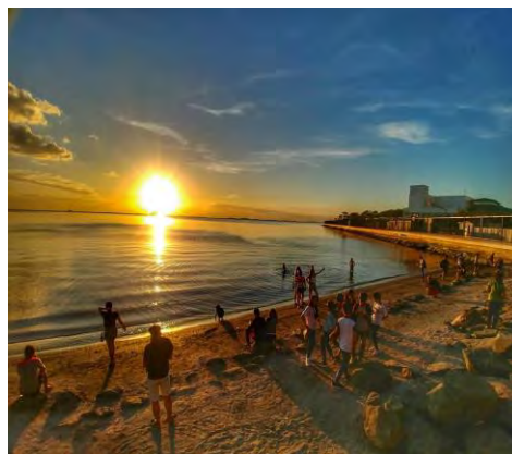
SUNSET ON MANILA BAY And possibly gleaming on the white sand.

But Paris Plages is only a temporary scheme. The beaches are there for the whole month of August, sometimes starting earlier in July, sometimes extending a few days into September. But it has been a major success, a brilliant scheme in city planning. In 2007, summer visitors attributed to these temporary beaches topped four million.