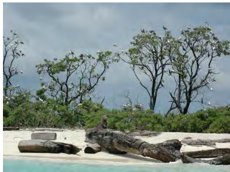
Tubbataha Reefs Natural Park

Lonely Planet, the largest travel guide book publisher, has cited two of the country's famous dive spots as among the six national parks around the world with offer a "surprisingly spectacular diving" experience.