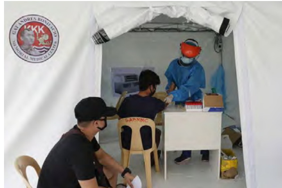
Health workers perform a rapid test on a man at a parking lot that has been converted into an extension of the Gat Andres Bonifacio Memorial Medical Center in Manila on Monday, August 3, 2020.

The Department of Health (DOH) on Tuesday logged 3,483 new confirmed Covid cases, based on the total tests conducted by 93 out of 110 current operational labs, which brings the total number of infections in the country to 224,264.