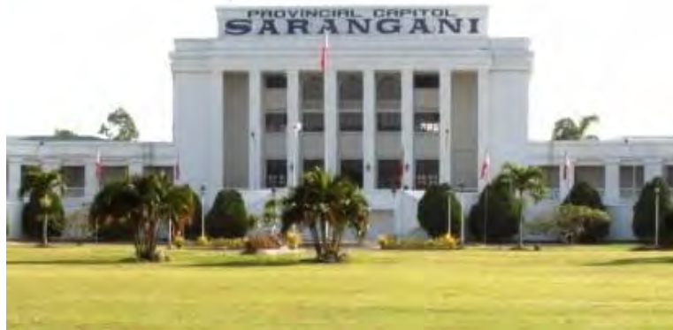
(Sarangani provincial capitol building)

By Allen Estabillo September 1, 2020, 3:49 pm