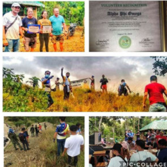
APO tree planting sa Daang Kalikasan

By Bombo Radyo Dagupan -August 30, 2020 | 4:31 PM