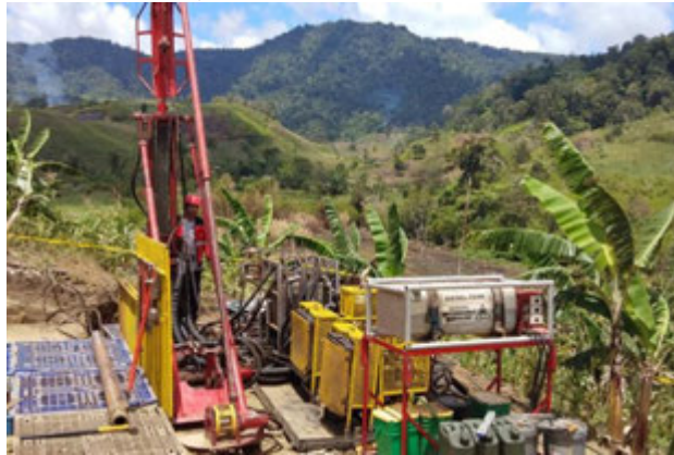
Site of the Sagittarius Mines, Inc's Tampakan mining operation in Mindanao, Philippines.

The US$5.9 billion project has faced opposition since mineral reserves were discovered there in the '90s, with pushback coming from indigenous communities, the Catholic church, environmentalists, and even communist rebels.