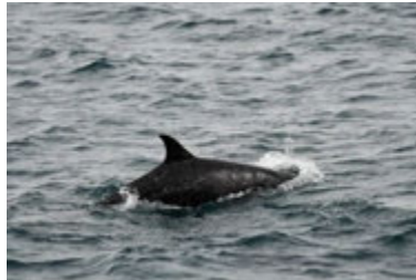
Photo of dolphins sight BFAR-12, DENR-12, and personnel of Sarangani Governor’s office at Sarangani Bay in Sarangani province.

ZAMBOANGA CITY – Several Risso and spinner dolphins have been frequently seen at the Sarangani Bay, near Malapatan and Alabel in Sarangani Province, which could be an indication that the bay has remained safe for such mammals to thrive.