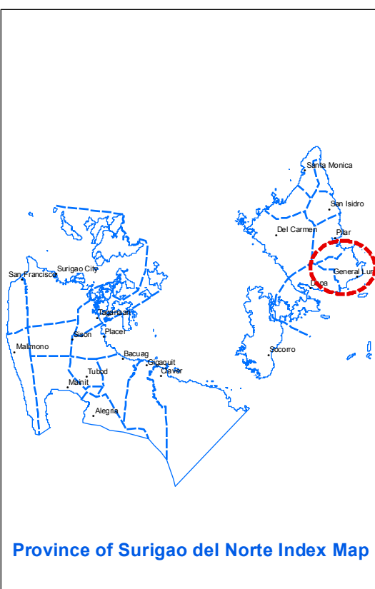
Province of Surigao del Norte Index Map

Caraga Regional Office No. XIII Tel. No. (086) 826-5256 http://www.mgb13.ph info@mgb13.ph